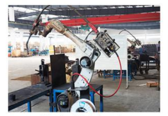
Welding Workshop 🔺