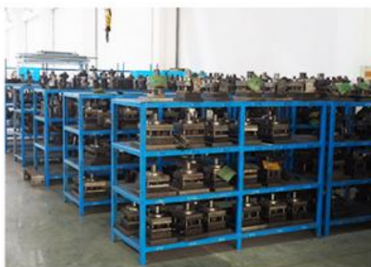
Mold Library ▲