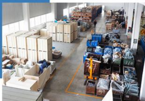
Packaging Workshop ▲

HENGTONG Is located in WUXI, close to Shanghai Port. Our products are exported to Southeast Asia, South Africa, Europe, Canada, Mexico, and America. We are experienced, professional, friendly, and eager to help with any need, from simple to custom manufactured products.