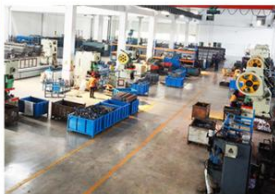
Stamping Workshop ▼