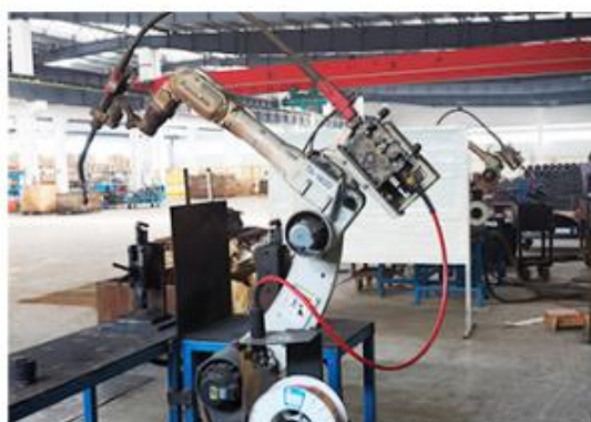
Welding Workshop ▲